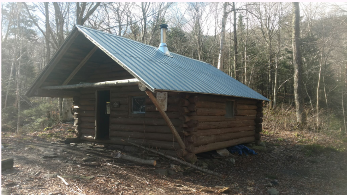
Beaver Meadow Lodge, November 2017